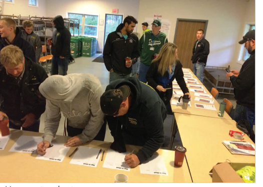
Green Up event volunteers