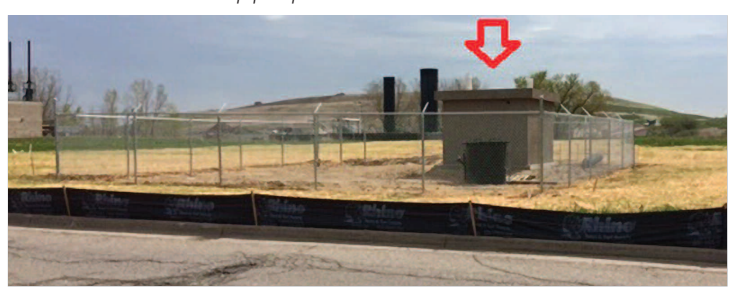
New sewer pumping station on east side of Giddings Rd. north of Silverbell Rd.