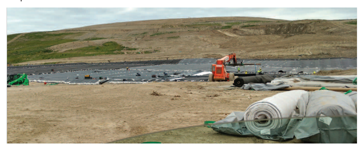
This view is facing east into Cell 12b.

In addition to new Cell 12a completed last summer, throughout the month of June, Waste Management completed the installation of Cell 12b. Cell 12b is to the north of Cell 12a and was not as visible from Silver Bell as Cell 12a installation was in 2015. Waste Management will begin disposing of waste in Cell 12b this September.